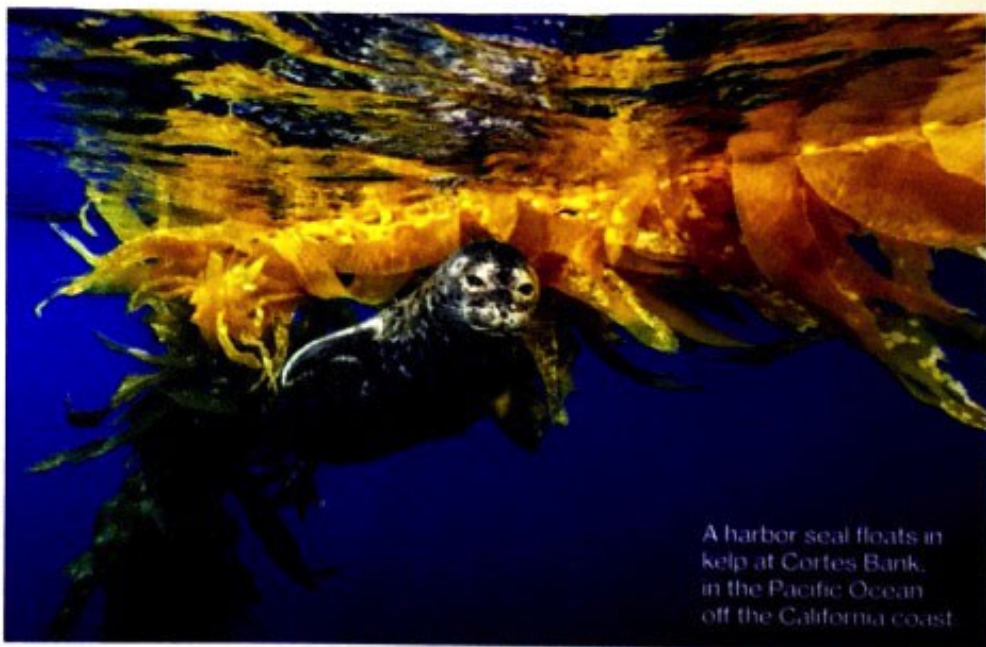
A harbor seal floats in kelp at Cortes Bank, in the Pacific Ocean off the California coast

By Cris Wickham