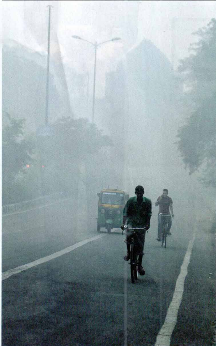
● Schools were closed in New Delhi as air pollution reached levels 10 times those in notoriously smoggy Beijing.

● Donald Trump sent mixed messages on North Korea during his Asian trip, saying it would make sense for Kim Jong Un to come to the negotiating table but also attacking his regime for turning the country into "a hell no one deserves."