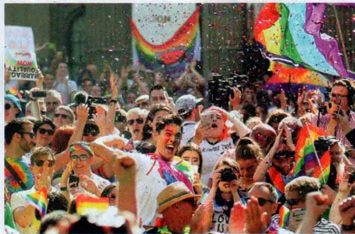
● Australian voters approved gay marriage, voting 61.6 percent in favor. Prime Minister Malcolm Turnbull called for Parliament to pass legislation by Christmas.

● Recent Asian summits have produced little progress on trade. Discussions of a new 11-country Trans-Pacific Partnership failed to yield a hoped-for framework, and China-led talks on a rival Regional Comprehensive Economic Partnership also concluded without an agreement.