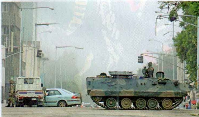
● Tanks patrolled Harare, Zimbabwe's capital, after the military detained 93-year-old President Robert Mugabe, who's led the country since 1980. > 12

● The U.S. launched drone strikes in Somalia against al-Shabab and the Islamic State, in cooperation with the country's government.