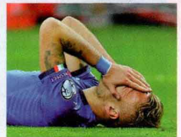
● For the first time since 1958, Italy's national soccer team failed to qualify for the World Cup.

● Airbus sold $50b worth of its A320neo planes in a deal at the Dubai Air Show, outdoing a $20 billion deal struck by Boeing.