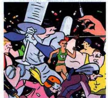
Sports doping Performance-enhancing drugs are still rampant in sports. There are ways to reduce their use: leader, page 14. Why no one seems to want to do so, page 55