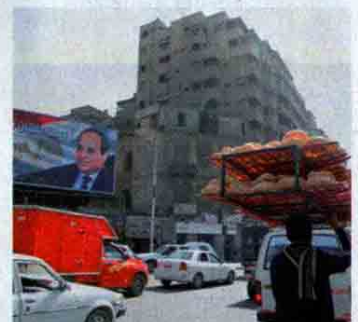
Egypt What fuel, bread and water reveal about how the country is mismanaged, page 43