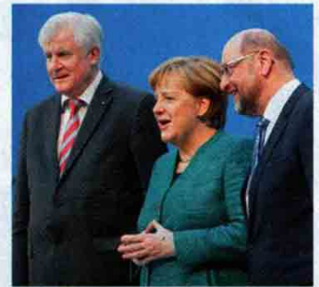
German politics A new government at long last. Unfortunately, it will look very like the old one: leader, page 12. Germany's main parties conclude a coalition deal, page 48