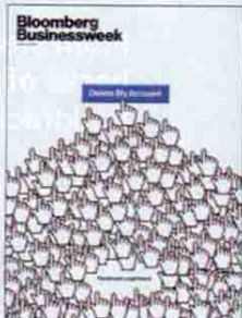
Cover: Illustration by 731