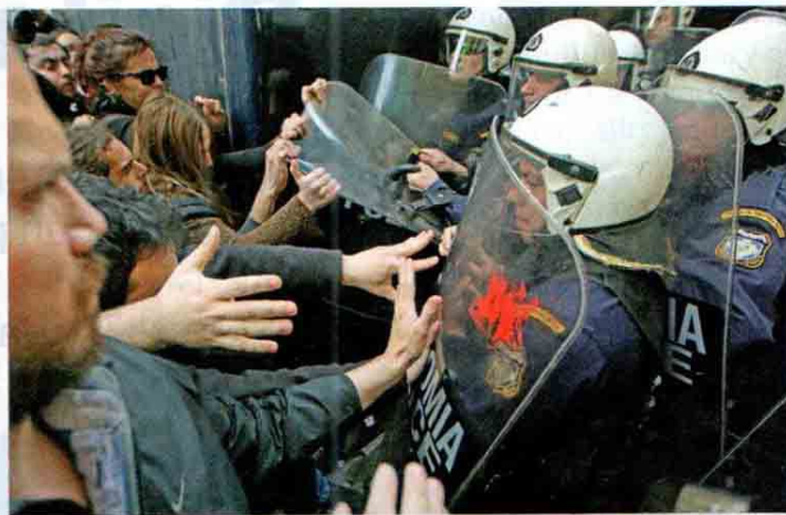
● Riot police block protesters attempting to disrupt an auction of foreclosed properties in Athens on March 21. The Greek government has been attempting to relieve banks of nonperforming loans, prompting left-wing demonstrations.

Bayer and Monsanto must still persuade U.S. regulators, who are pushing the companies to divest more assets.