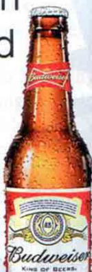
Anheuser-Busch InBev CEO Carlos Brito told Bloomberg Television he's bullish on his business.

● “Today, you go to a restaurant in New York City—or any major metropolitan area, for that matter—and you have a wine list and you have a beer list.”