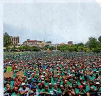
● South African miners gathered outside government offices in Pretoria to protest diminishing job prospects and declining salaries.

● Former French President Nicolas Sarkozy was held for questioning about allegations that he received illegal campaign contributions from the late Libyan leader Muammar Qaddafi. The corruption probe has been under way since 2013. Sarkozy has called the charge “grotesque.”