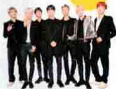
BTS SOUTH KOREAN POP BAND