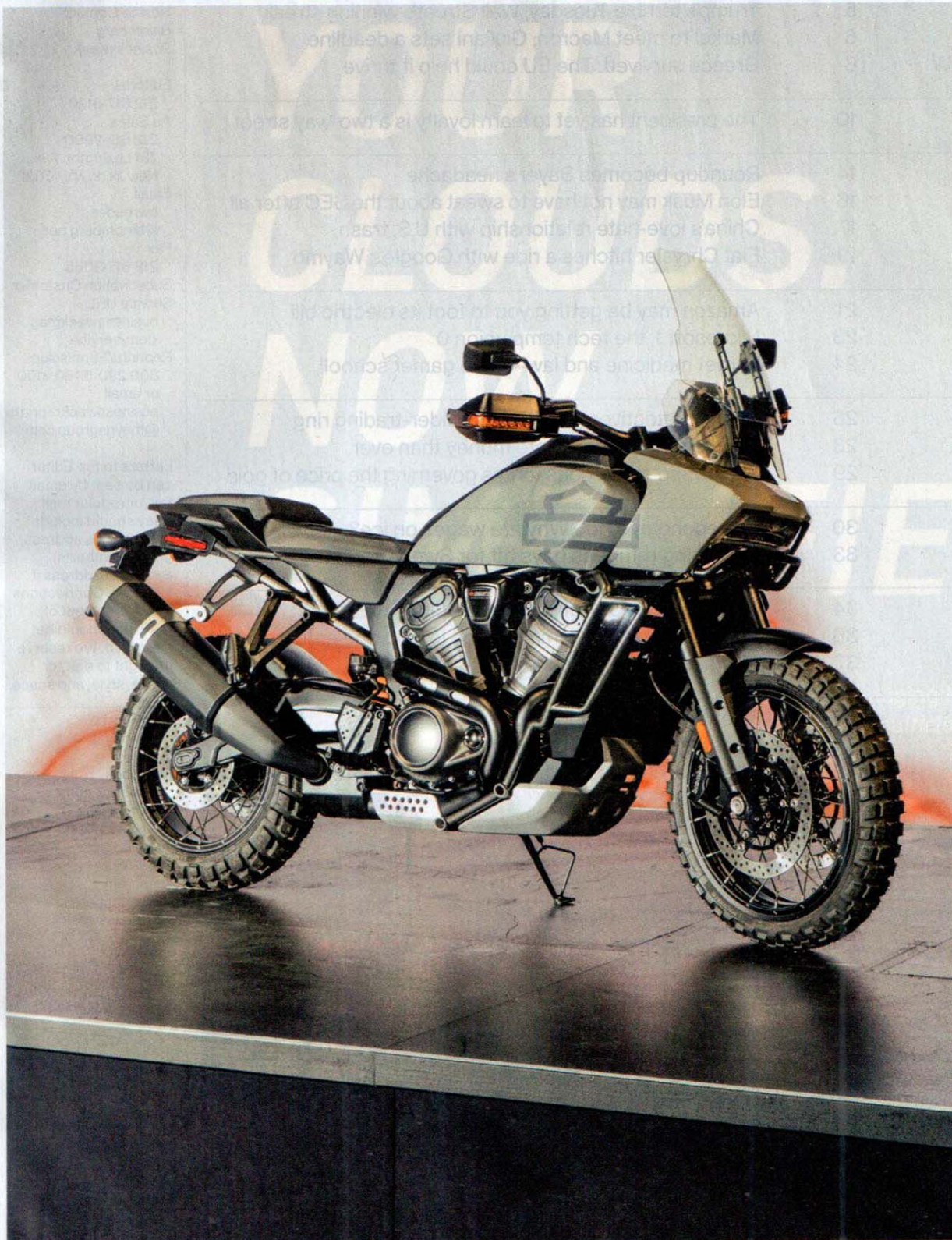
◀ A prototype of Harley-Davidson's Pan America adventure bike