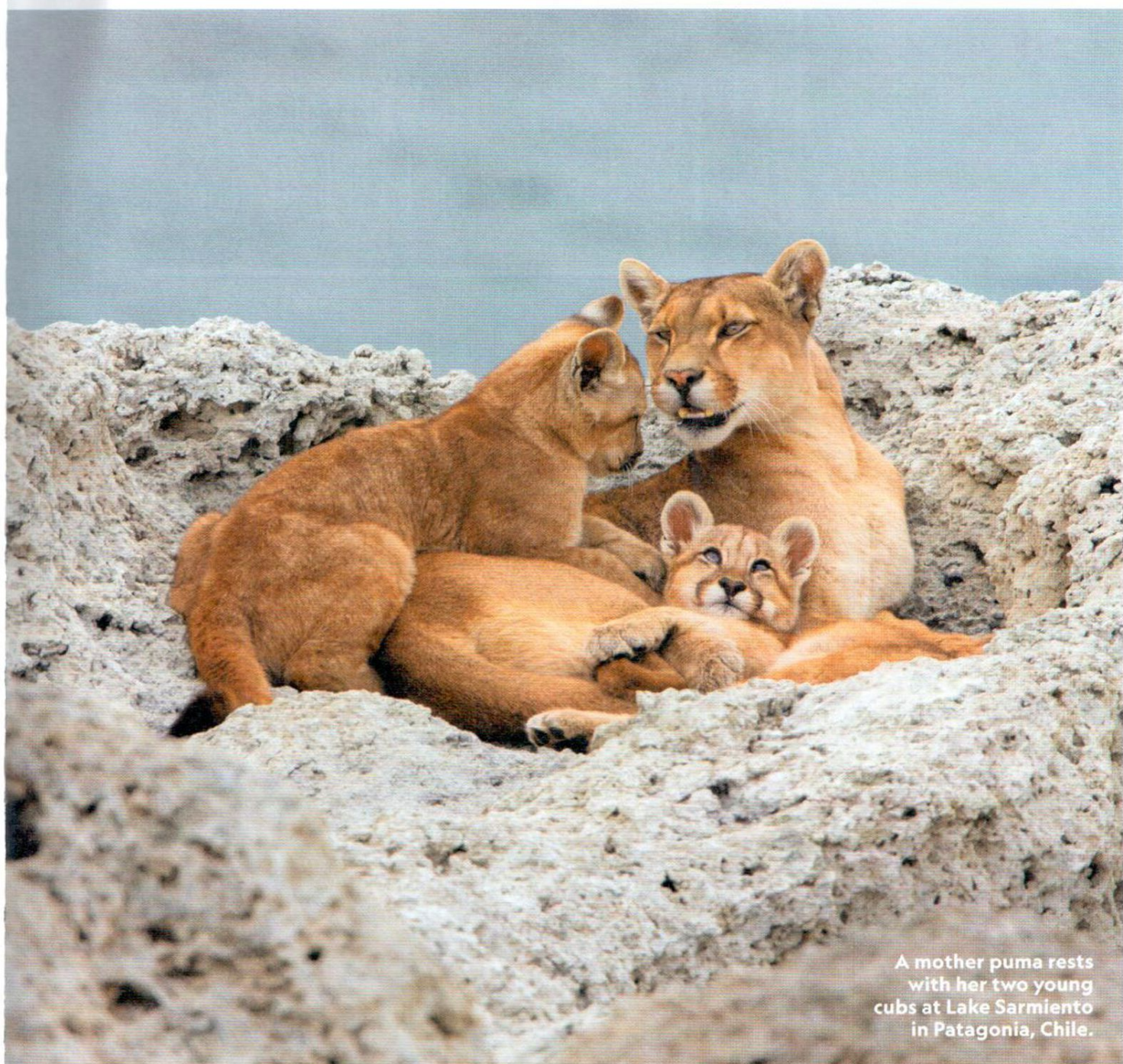
A mother puma rests with her two young cubs at Lake Sarmiento in Patagonia, Chile.