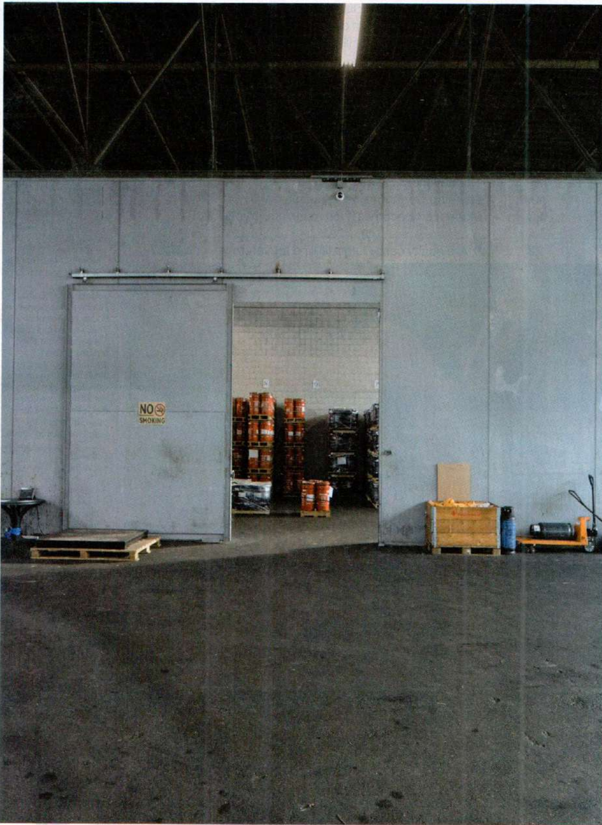
◀ Cobalt 27 Capital in Rotterdam has the largest private stockpile of the metal on Earth