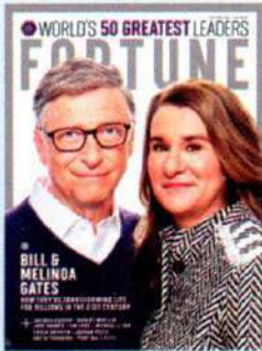
▲ ON THE COVER: PHOTOGRAPH BY SPENCER LOWELL